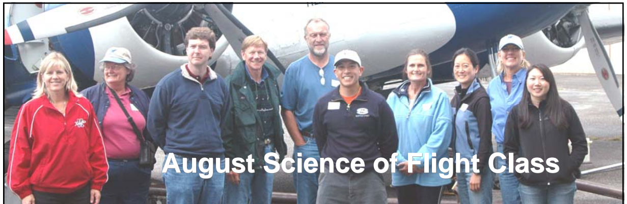
August Science of Flight Class